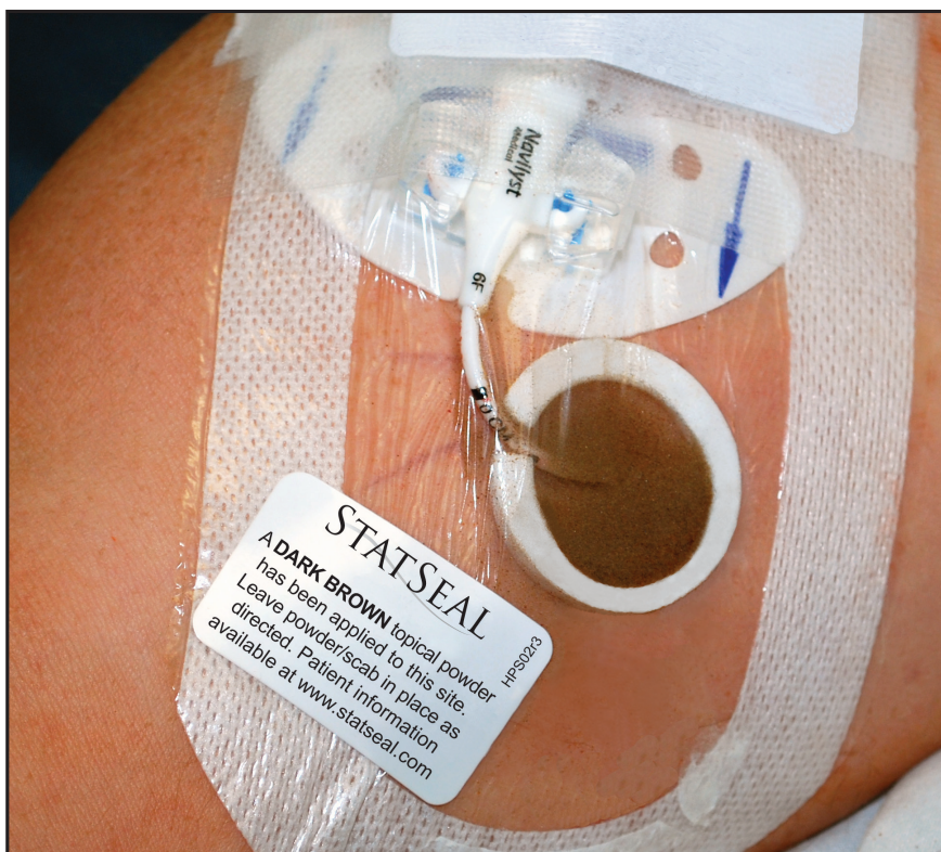
StatSeal Powder with PCD (Powder Containment Device).

StatSeal Powder has been applied to the patient's access site. Do not be concerned by the color of the powder. The brown color is due to the powder ingredients.